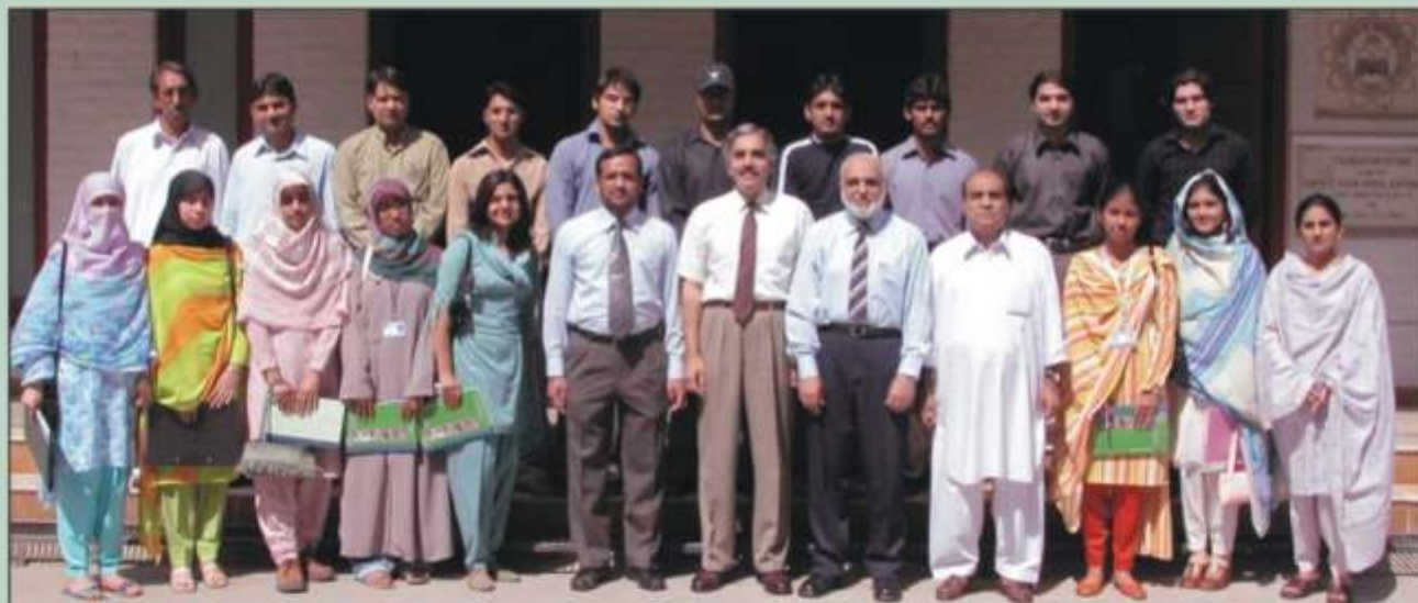
The delegation alongwith Vice Chancellor

A delegation of COMSATS Institute of Information Technology (CIIT), Islamabad, comprising faculty and twelve students from its campuses at Lahore, Abbottabad & Attock visited UET, Peshawar, under the "Inter-Provincial Exchange Programme" sponsored by HEC, from April 24-27, 2006. The visit was arranged to encourage inter-provincial