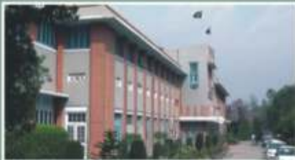
Main Campus, Peshawar